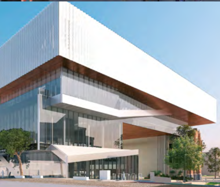
Left: H+O impression of New Museum view from Francis Street.

“The new museum is almost three times the size of the previous museum. It features state of the art exhibitions, exceptional visitor experiences, greatly improved accessibility and impressive architecture and design. This is a museum that all Western Australians can be proud of.”