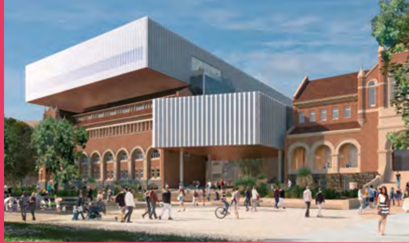
H+O impression of New Museum view from James and Beaufort Street.