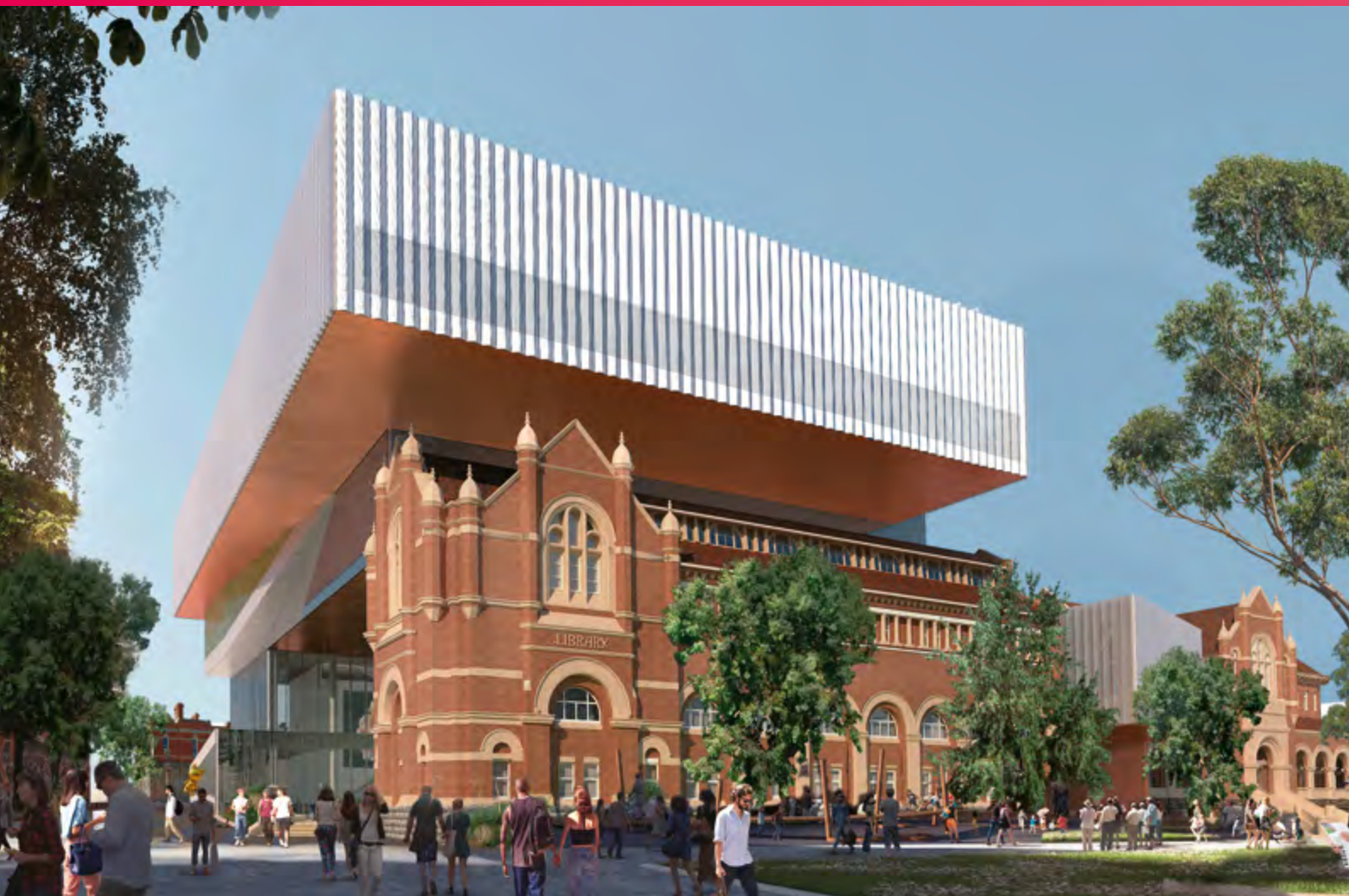
Above: H+O impression of New Museum view from James Street. © WA Museum, image courtesy Multiplex.